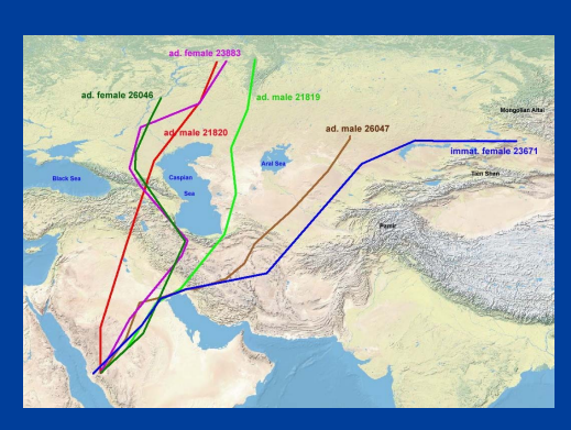
The spring migration routes of six Imperial Eagles wintering in Arabia